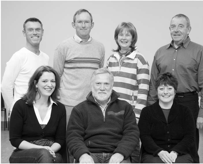
Welshampton and Lyneal Parish Council prior to the Annual Meeting on 1 May 2008.